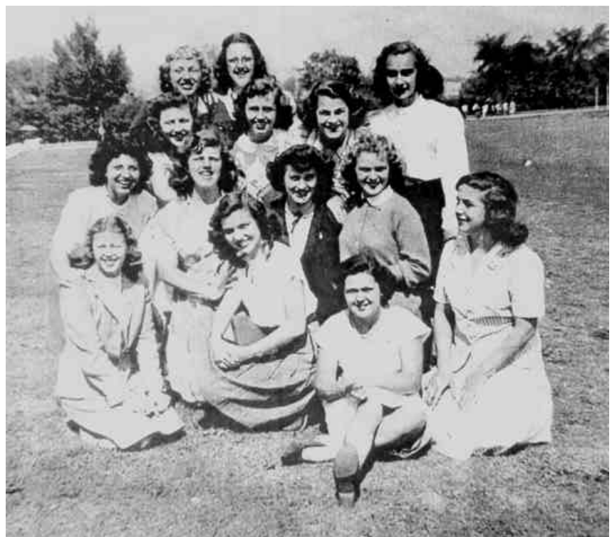
The Taft Girl's Club - formed in 1947- group still get together.